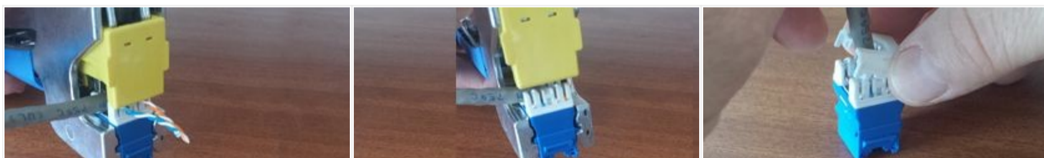
Insert jack into ezi-TOOL with yellow cutting blade