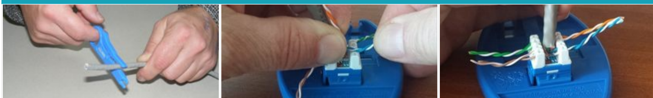
Strip 40mm of sheath from cable using stripper