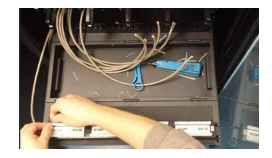
YouTube Demonstration Video